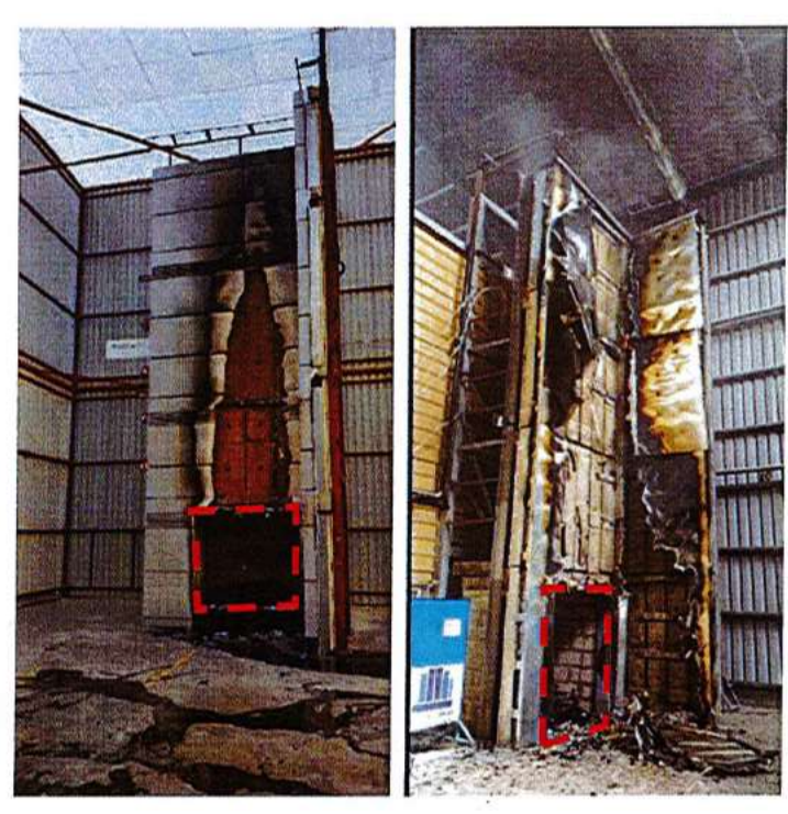
Figure 2 Comparative effect of the presence of cavity barriers adjacent to solid aluminium panels

NSW Government, 'Project Remediate Industry Briefing' by Allan Harriman, Cladding Product Safety Panel Member, 1 September 2021. The panels on the left had barriers installed while the panels on the right did not.